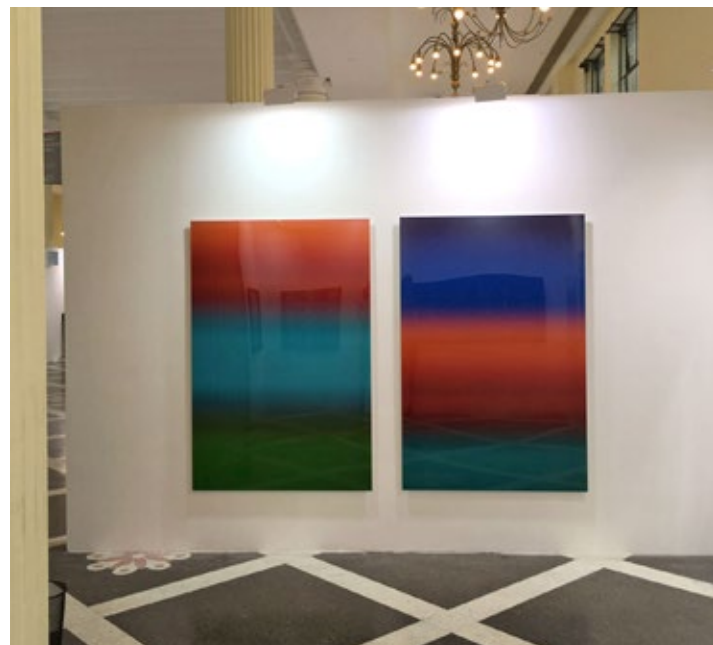
Photo Shanghai Shanghai Exhibition Center 1000 Yan'an Road (near Tongren Road) Shanghai - China http://www.photoshanghai.org/en/

Samuel Maenhoudt Gallery De Wielingen 3 8300 Knokke - Belgium http://samuelmaenhoudt.com/