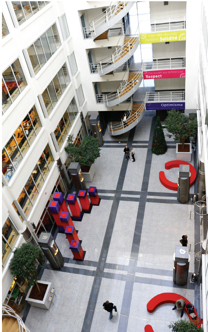
View of the atrium of more than 8000 m 3 of Beobank from the top floor

Measuring 27 meters wide on the side, 12 meters deep and 25 meters high, the atrium is a very luminous passage. It just lacked a monumental masterpiece to be completely decorated. Therefore, the goal was to occupy the space, bring color and hide the cafeteria situated on the side while letting light go through at the same time.