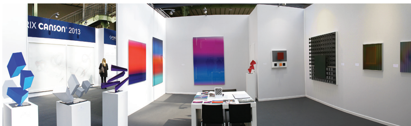
Stand of the 2013 edition.