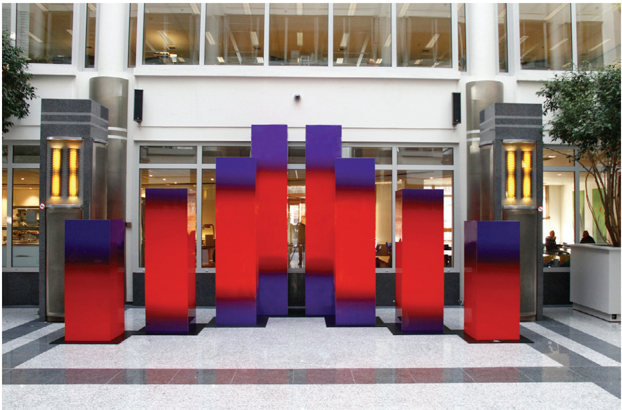
Crescend'O installed in the headquarters of Beobank in 2013.

It is on 24 February that Crescend'O , the installation created by Yves Ullens for the Brussels headquarters of Beobank, was officially inaugurated. It is a masterpiece of 8 deep red and purple blue columns that the photographer has installed in the luminous atrium of the bank.