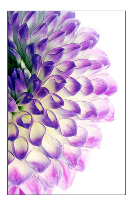
Born in St. Paul, Minnesota USA (1969). Lives and works in New York.